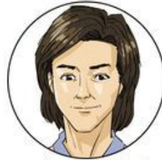
水老师 (Shuǐ Lǎoshī)